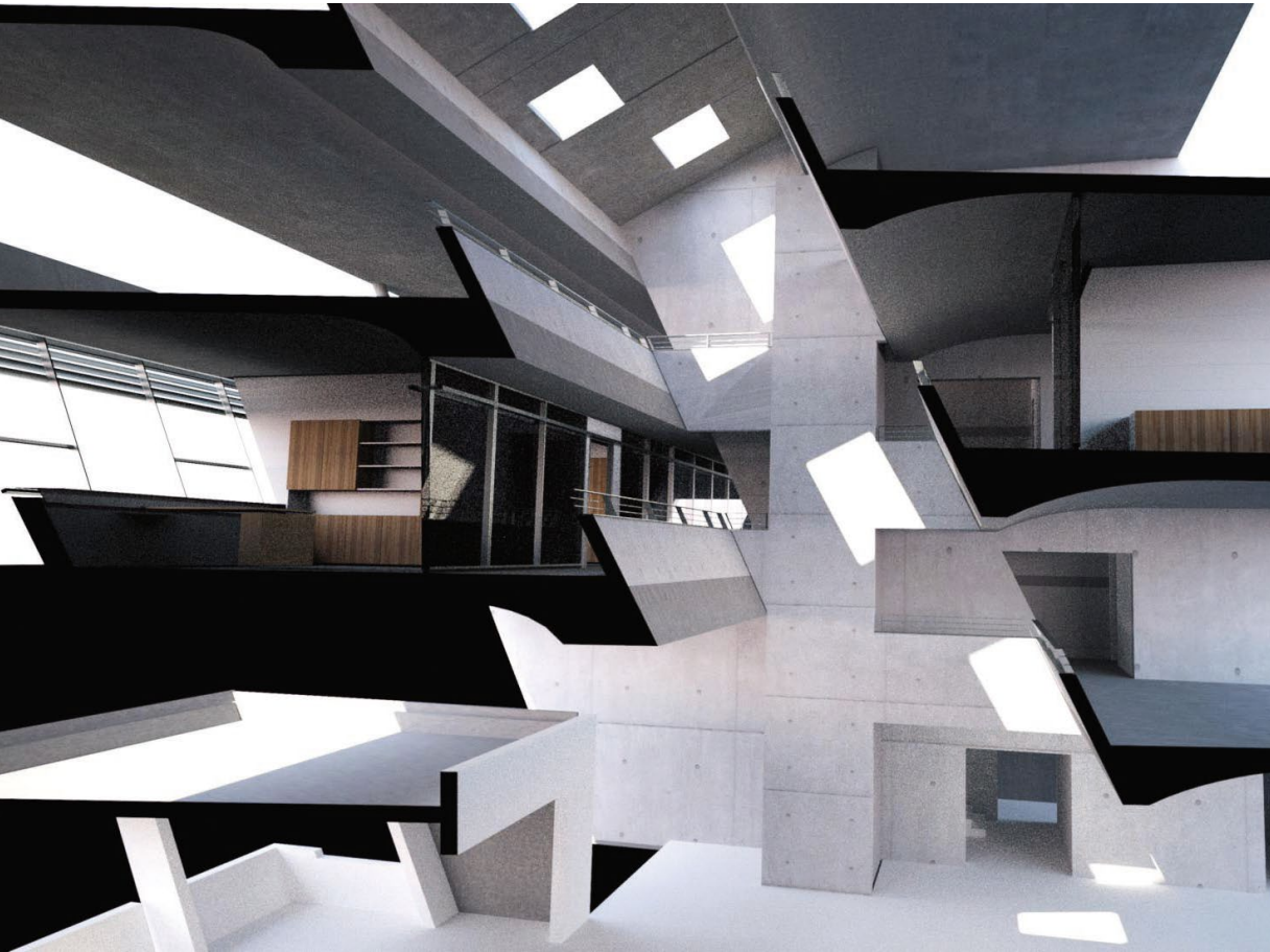
E.ON administration building, Germany